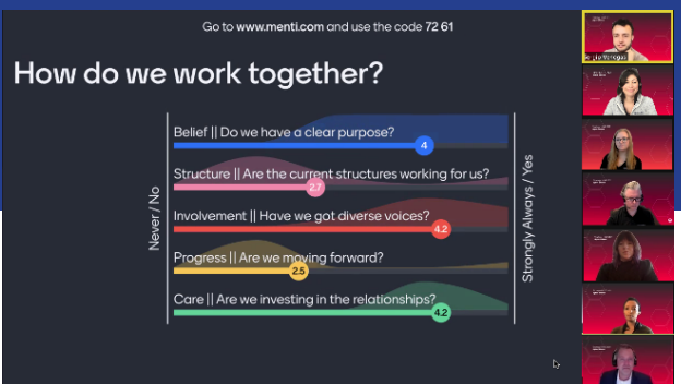
Group ideation on vision and strategy